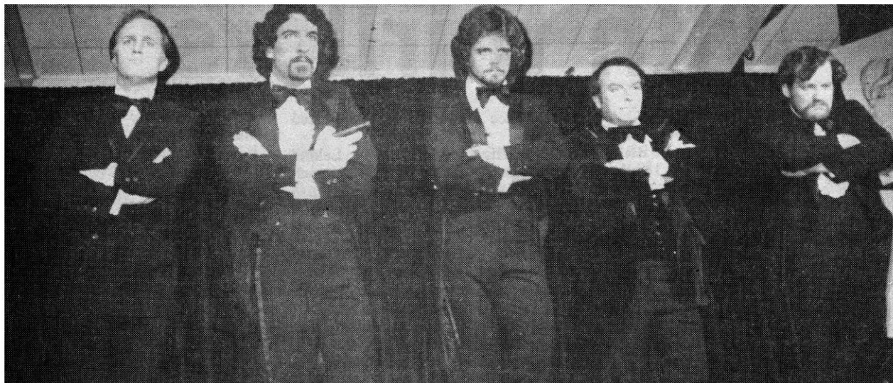
TOUGH GUYS — Not all of Rodgers and Hart's songs were love songs, as illustrated by "It's a Lovely Day for a Murder." Making up the villainous quintet are, from left,