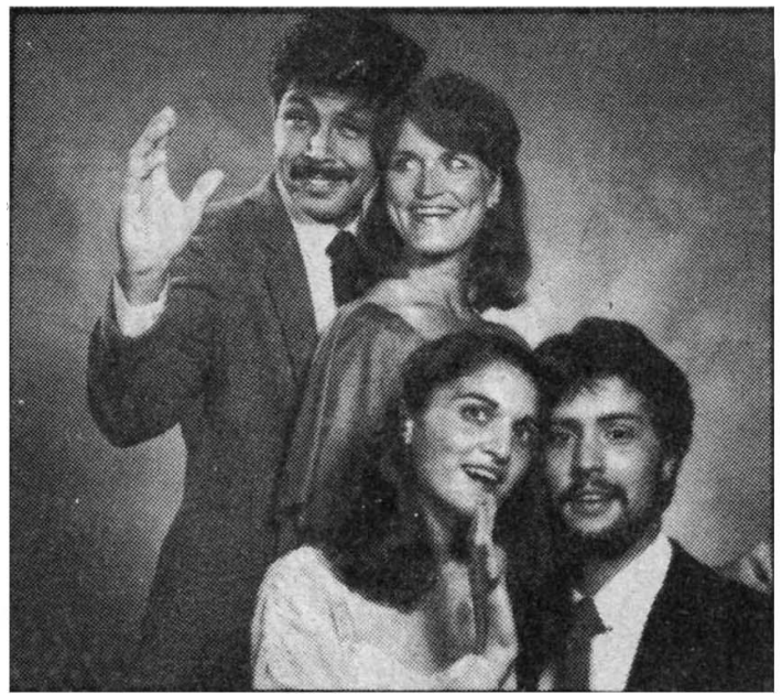
GCT's 'Side by Side' is nearly sold out.

Call now to see Gilroy Community Theatre's dinner show, Side by Side by Sondheim . Tonight's dinner show and both of Saturday's shows are already sold out, as is the final show next Saturday. If you call 842-SHOW quickly, you may still get a $7.50 seat for the 10 p.m. show tonight or a seat for one of two shows the next Friday: the $15 dinner show at 6:30 or the $7.50 show at 10. All shows are at the Old Gilroy Hotel.