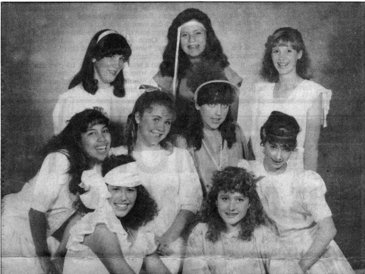
Special to The Dispatch

Cast members sing "Perfect Young Ladies" in "The Boyfriend," opening Friday in Gilroy.