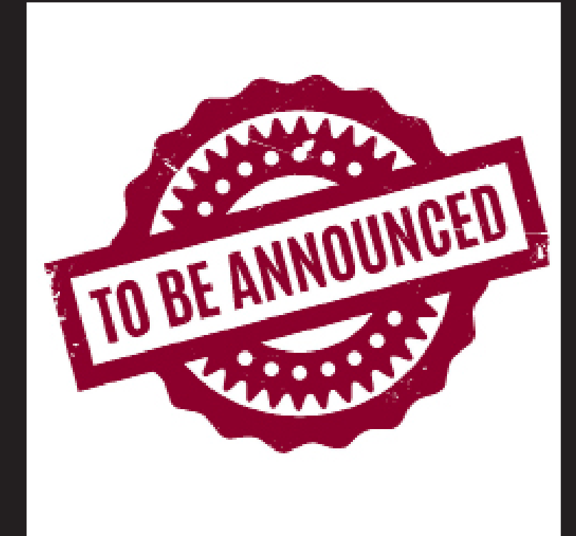
To Be Announced Award Winning Musical June 21 - July 13, 2025

This combines all the elements of a classic farce with a contemporary plot: In an economy motel room, an embezzling mayor is supposed to meet with his female accountant. In the room next door, two undercover cops are supposed to catch the meeting on videotape.