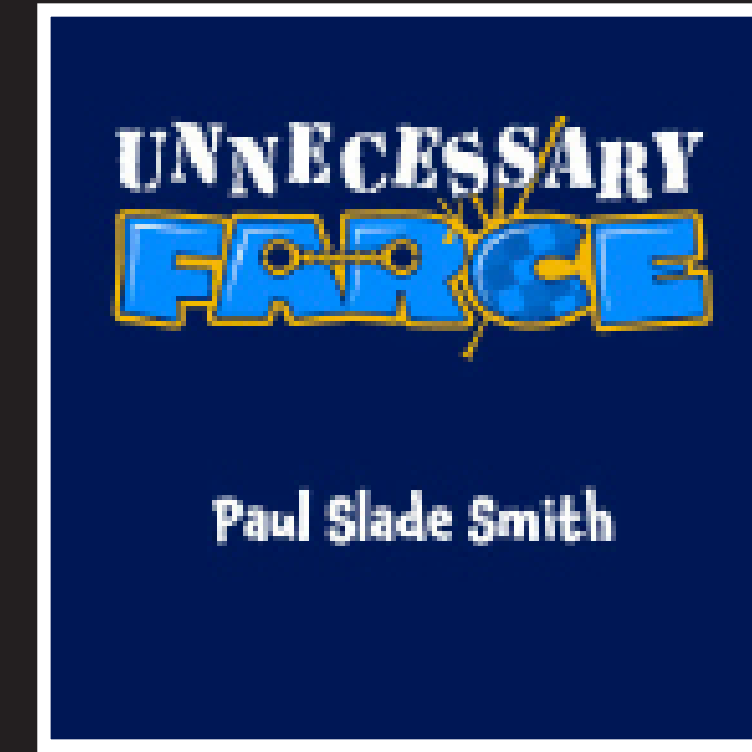
Unnecessary Farce Slapstick Comedy April 25 - May 17, 2025

Mean Girls takes a look at friendships—and human nature—through a ferociously funny lens.