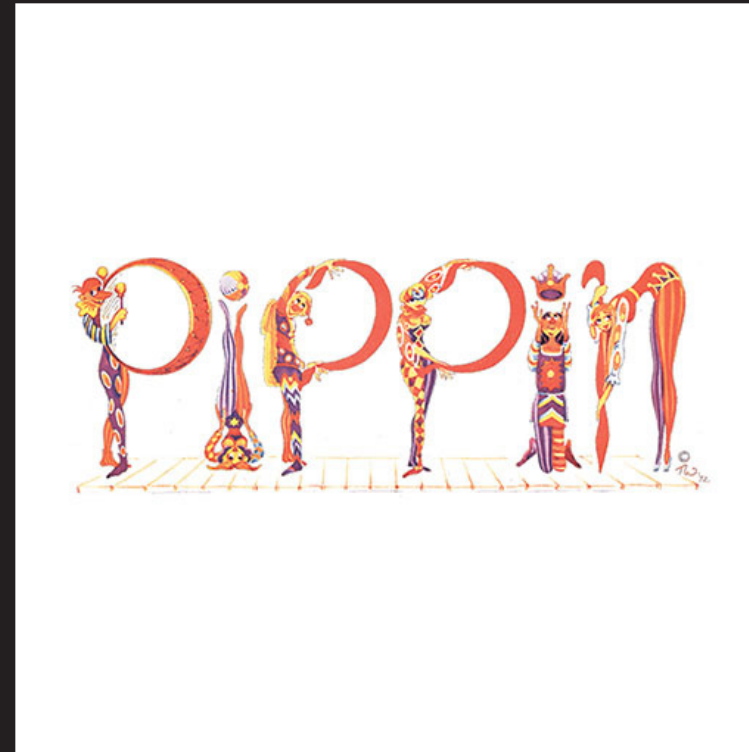
Pippin "There's Magic To Do" Nov 15 - Dec 7, 2024

When Nemo is captured, Marlin faces his fears and sets off on an epic adventure across the ocean. Finding Nemo JR brings a vibrant underwater world to life on stage in a story full of family, friendship, and adventure.