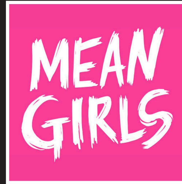
Mean Girls Teen Production Feb 21 - March 15, 2025

With music and lyrics by Stephen Schwartz, Pippin opened on Broadway in 1972 where it ran for almost 5 years and received five Tony Awards. The 2013 revival received four Tony Awards including Best Revival of a Musical.