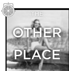
The Other Place Psychological Mystery Jan 16 - Feb 01, 2026