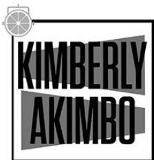
Kimberly Akimbo Quirky Comedy Aug 29 - Sep 14, 2025