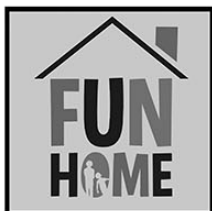
Fun Home Musical Memoir Nov 14 - Dec 6, 2025