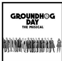
Groundhog Day 'Timeless' Comedy Jun 19 - Jul 18, 2026

Resident Company of the Morgan Hill Community Playhouse with additional productions at SVCT's Limelight Theater