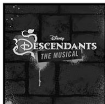
Disney's Descendants Youth Musical Oct 03 - Oct 18, 2025