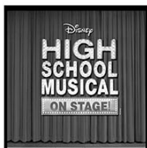
High School Musical Teen Musical Feb 20 - Mar 14, 2026