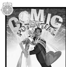
Comic Potential Romantic Comedy Apr 24 - May 16, 2026